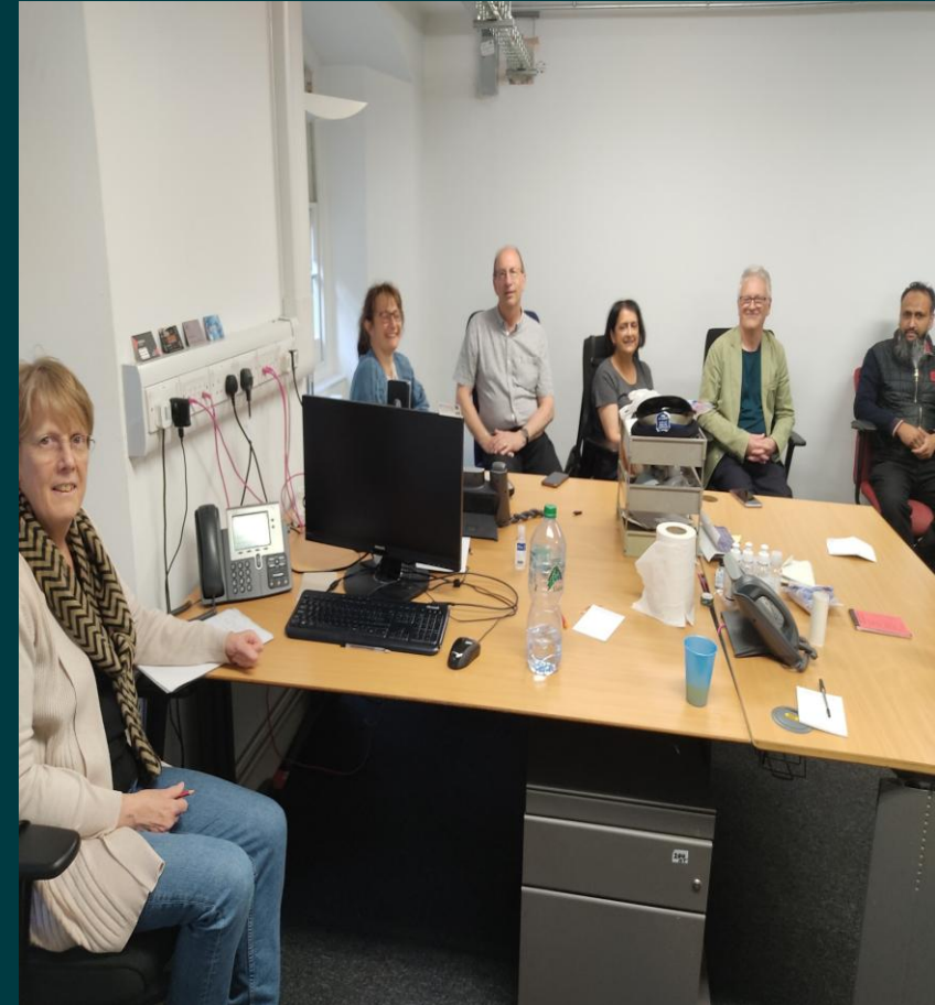
Our first set of ward panel post-covid